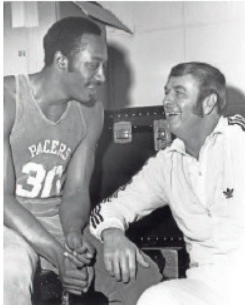
Indiana Pacers star George McGinnis chats with coach Bobby "Slick" Leonard in this undated photo.