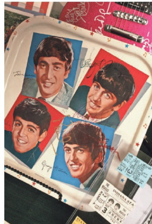
The collection of Indianapolis native Tom Fontaine includes this tray signed by all four members of the Beatles between 1975 to 1992.

from a 1967 appearance on "American Bandstand." The pages of "Rare" transcend an inventory of items (and more than 2,000 are collected here) by sharing personal letters and memories from people who were close to the stars of music, film, TV and sports. For Indianapolis native Fontaine, a passion for collecting started with a batch of Beatles trading cards in 1964.